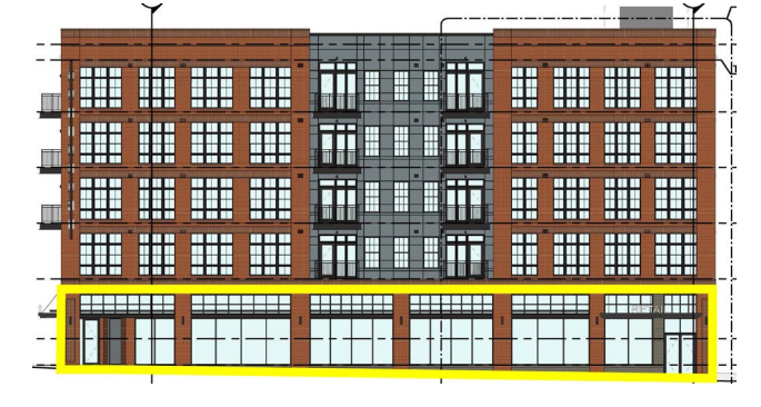
View from Hull Street