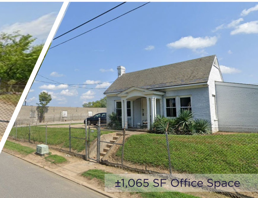
±1,065 SF Office Space