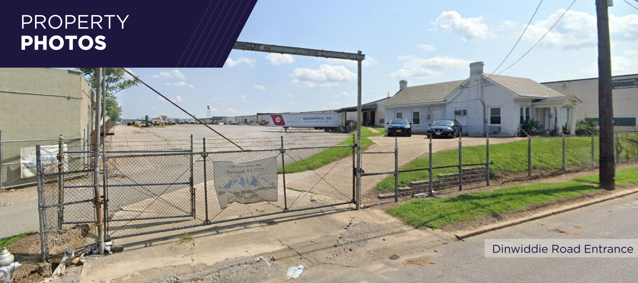
Dinwiddie Road Entrance