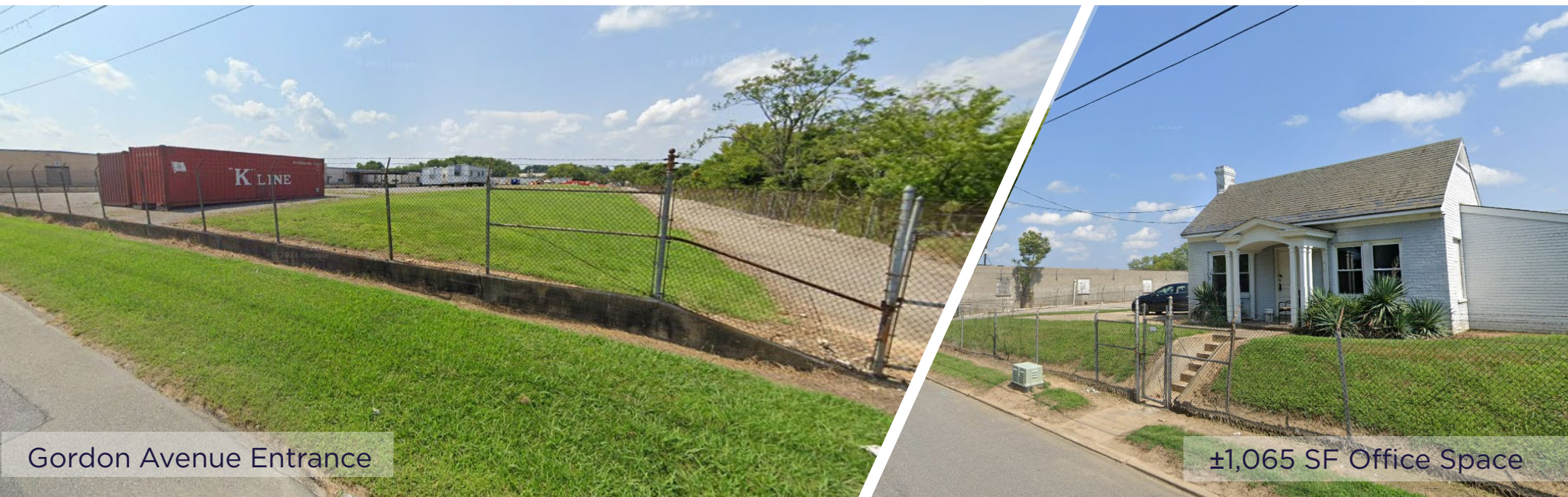
Gordon Avenue Entrance