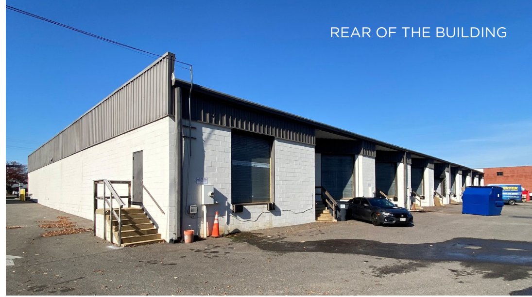
REAR OF THE BUILDING