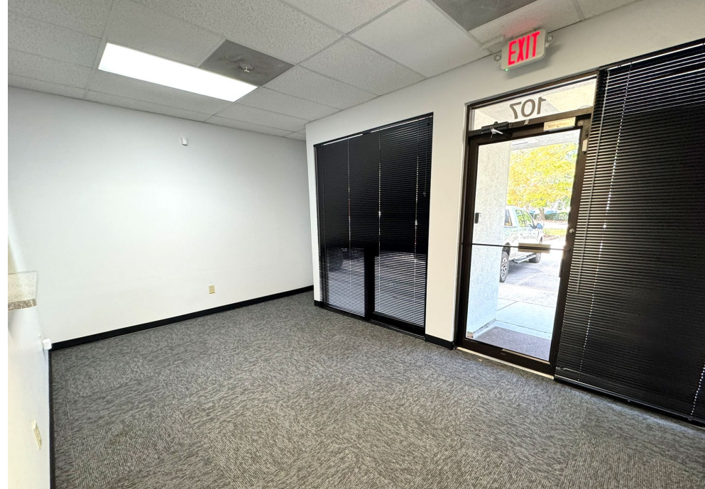
Well-appointed office space with updated carpet and lighting