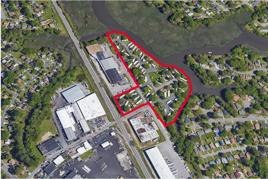
Central Mobile Home Park