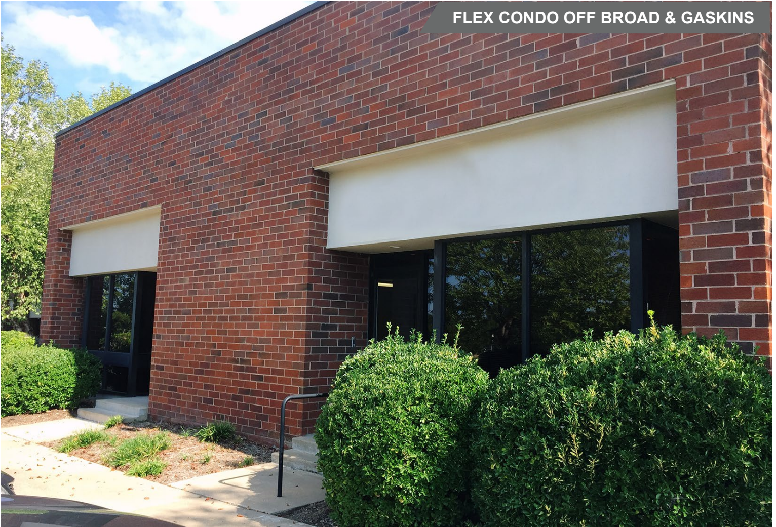
FLEX CONDO OFF BROAD & GASKINS