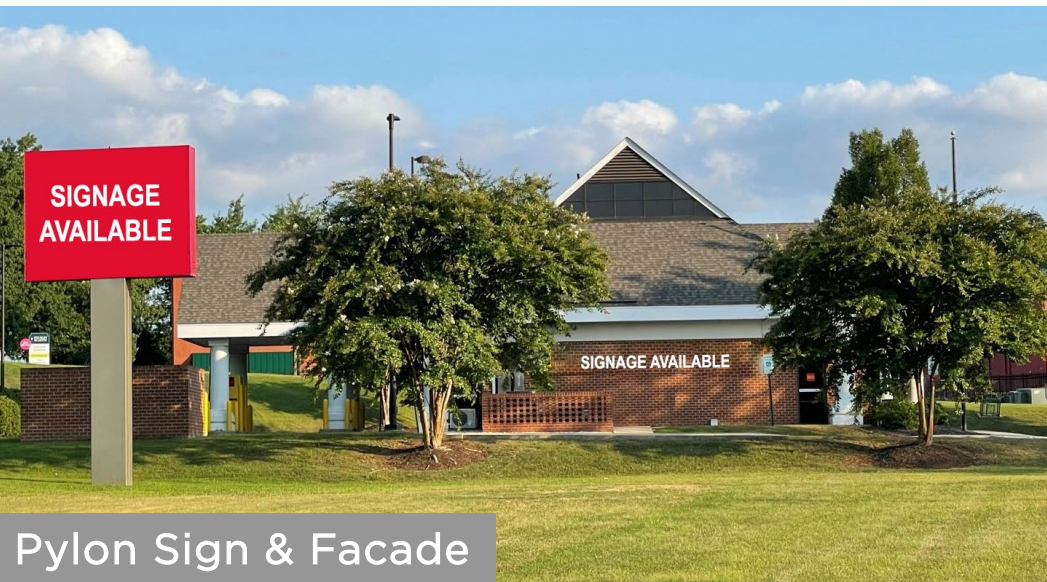
Pylon Sign & Facade