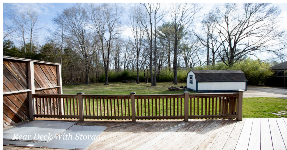
Rear Deck With Storage