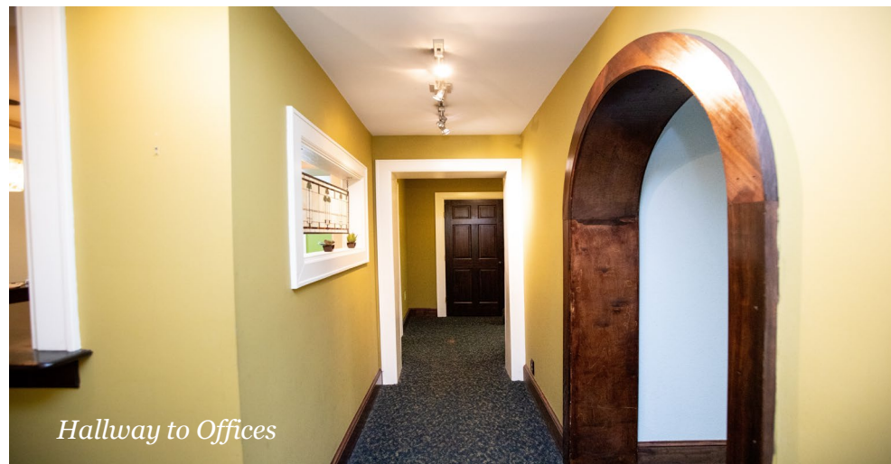
Hallway to Offices