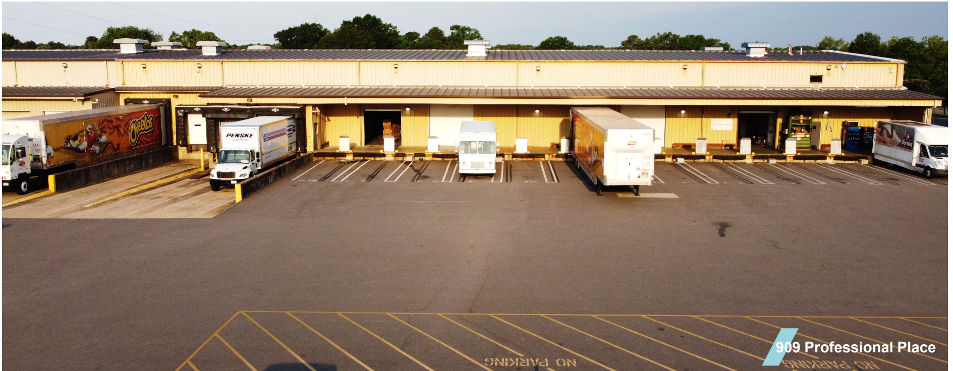
909 Professional Place