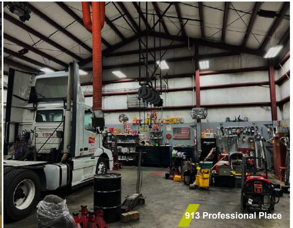
913 Professional Place