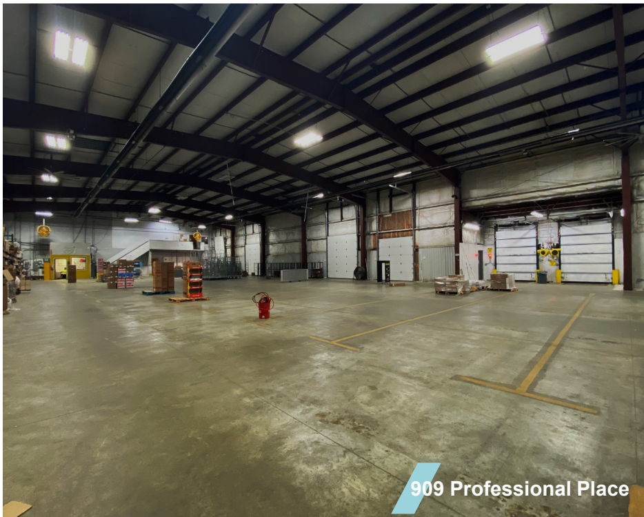
909 Professional Place