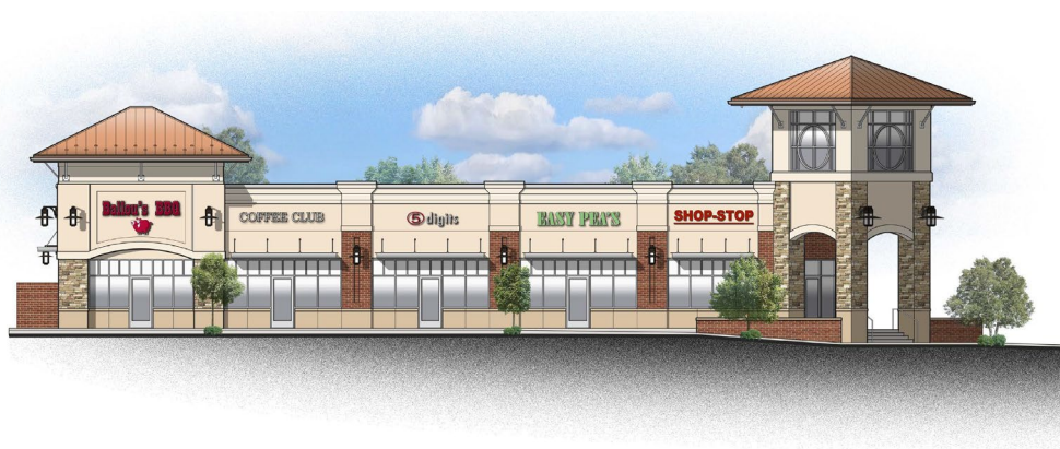
FUTURE RETAIL SHOP SPACE