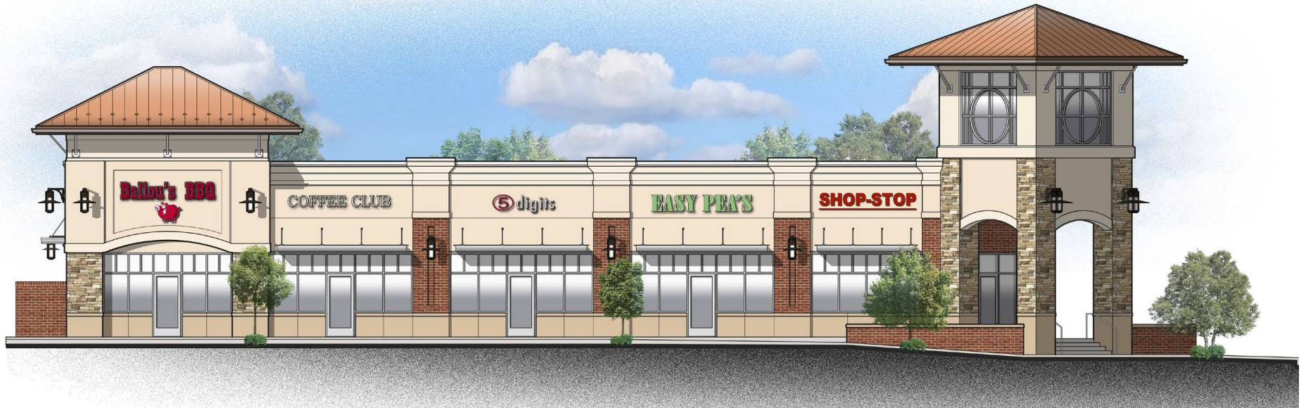
FUTURE RETAIL SHOP SPACE