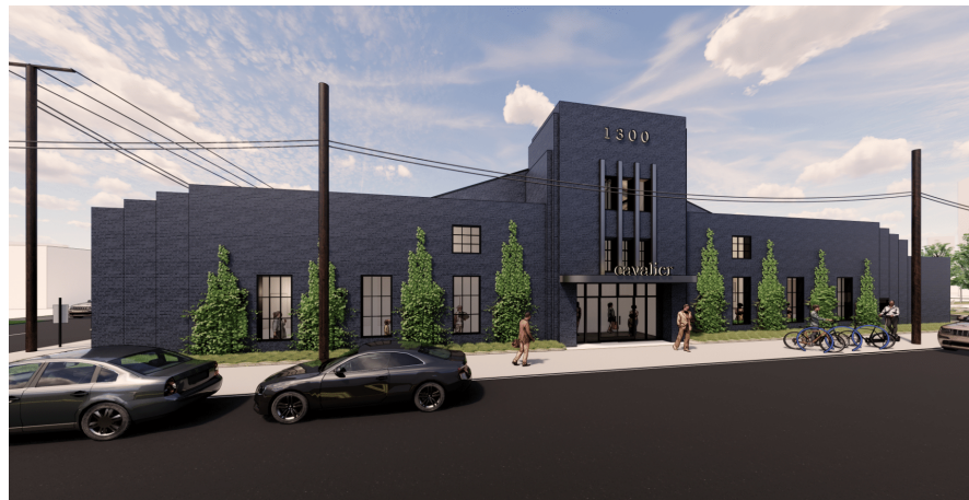
Planned Renovations for Adjacent Building at 1300 MacTavish