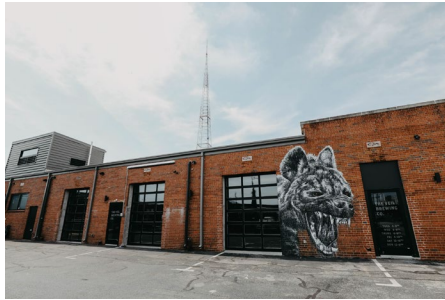
The Veil Brewing Co.