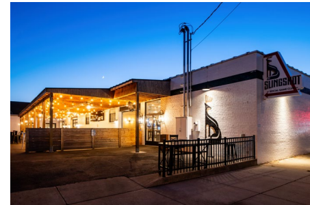
Slingshot Social Game Club