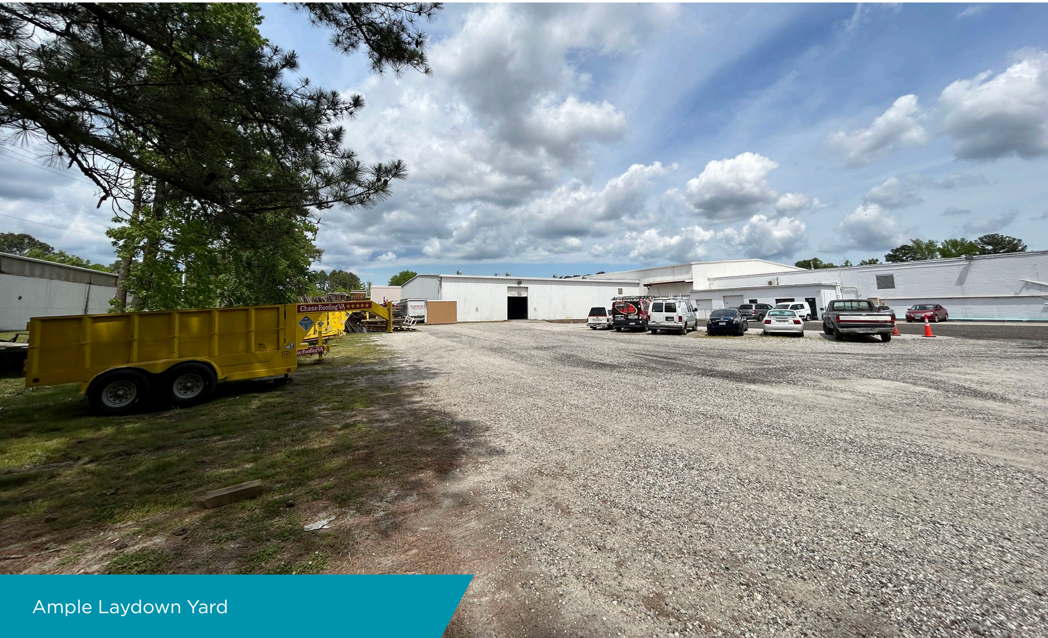
Ample Laydown Yard

Independently Owned and Operated / A Member of the Cushman & Wakefield Alliance