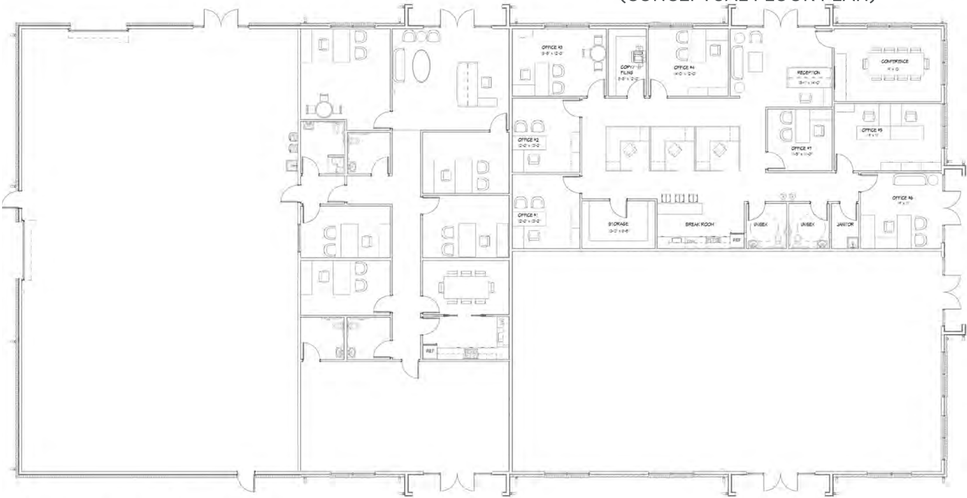
1ST FLOOR PLAN FUTURE OFFICE LAYOUT