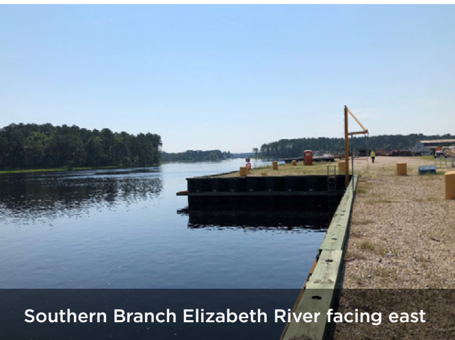
Southern Branch Elizabeth River facing east