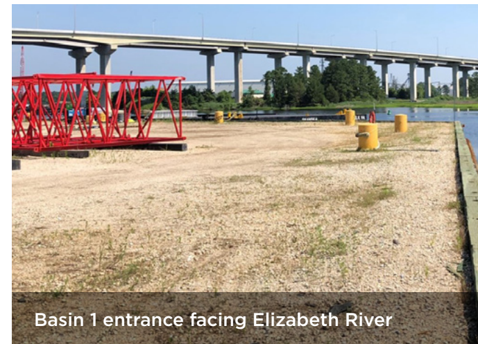
Basin 1 entrance facing Elizabeth River