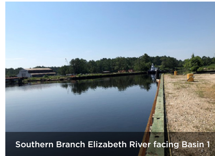
Southern Branch Elizabeth River facing Basin 1