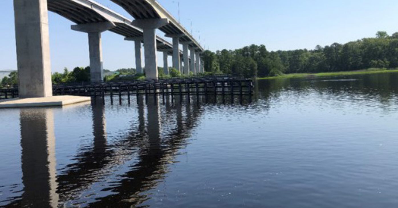
Veteran's Bridge (Dominion Blvd.)