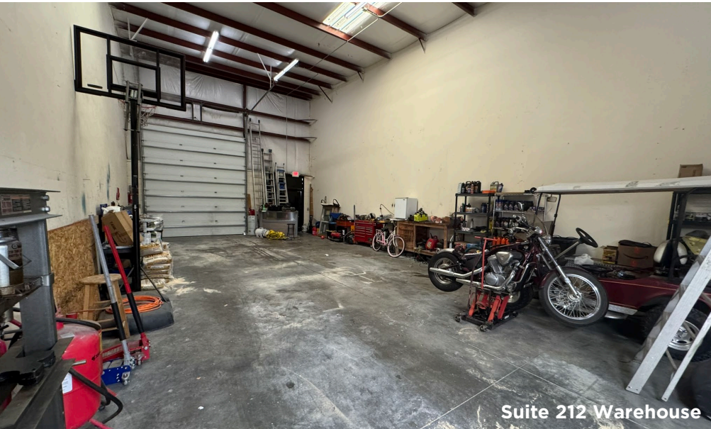
Suite 212 Warehouse