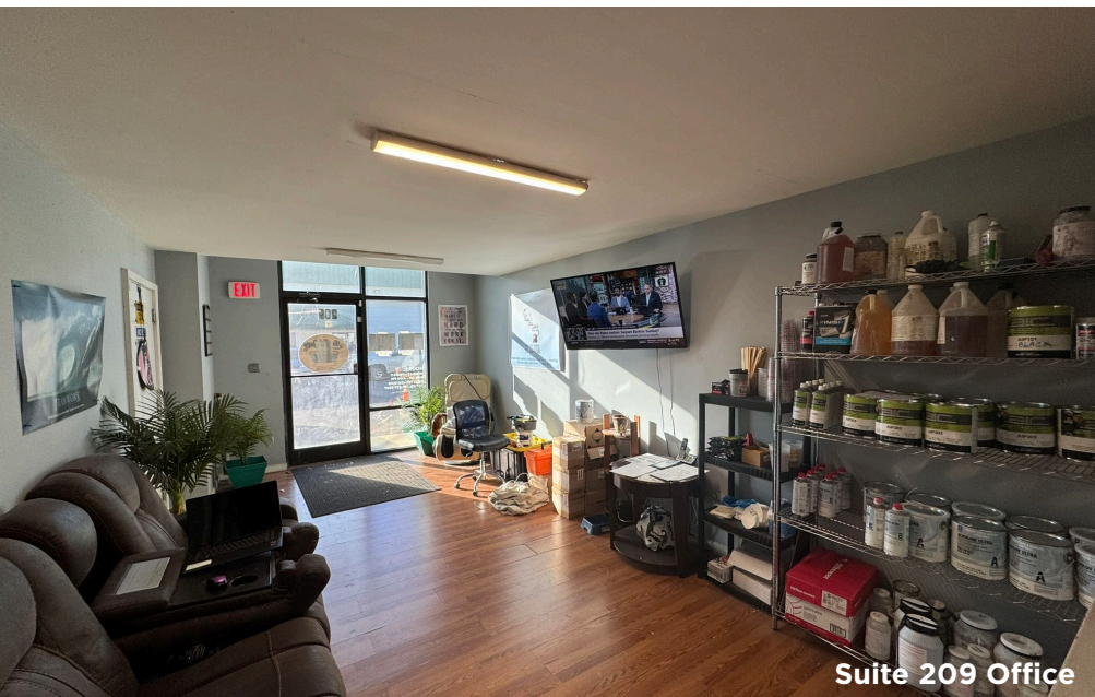
Suite 209 Office