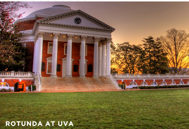
ROTUNDA AT UVA